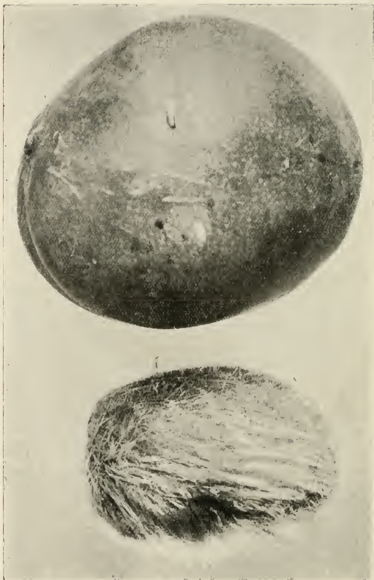
FRUIT AND SEED OF THE BISCOCHUELO MANGO, SANTIAGO DE CUBA. THIS IS ONE OF THE BEST SEEDLING TYPES IN THE ISLAND.